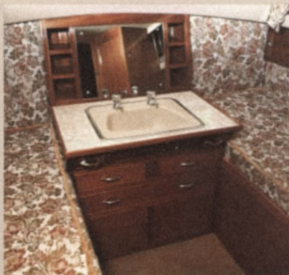
SPORTS AFT CABIN

The spacious sports aft cabin with full headroom is the essence of luxury accommodating two single berths vanity unit with hot and cold pressurised water and chest of drawers beneath, toilet compartment and hanging wardrobe.