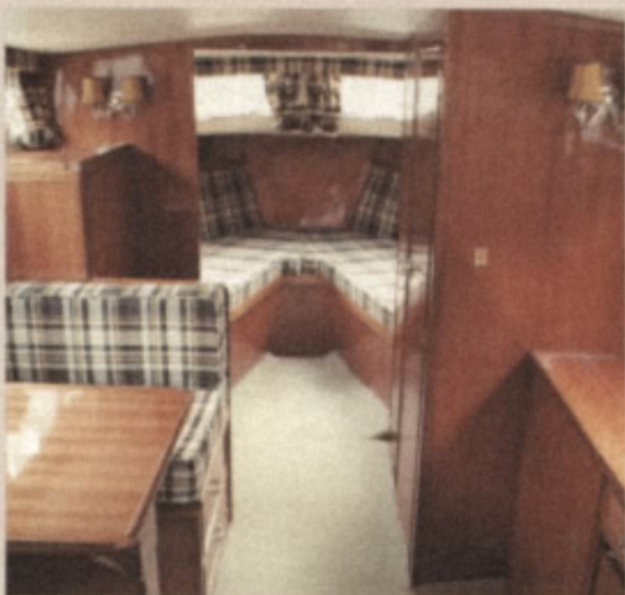
SPORTS FORWARD CABIN

A spacious main cabin comprising a dinette which converts effortlessly into a double berth with drawers beneath. Galley with stainless steel sink and draining board equipped with hot and cold water, cooker with oven grill and two burners, electric fridge plus many storage cupboards above the galley is a crockery locker and cocktail cabinet, in fact, all available space has been utilized to give