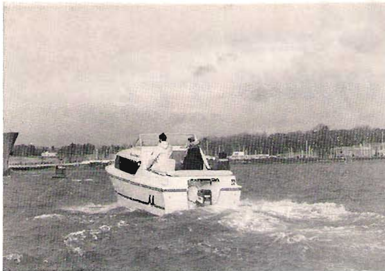
Shown with 75bhp Yamaha