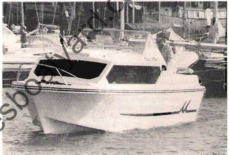
Easy to handle in the marina