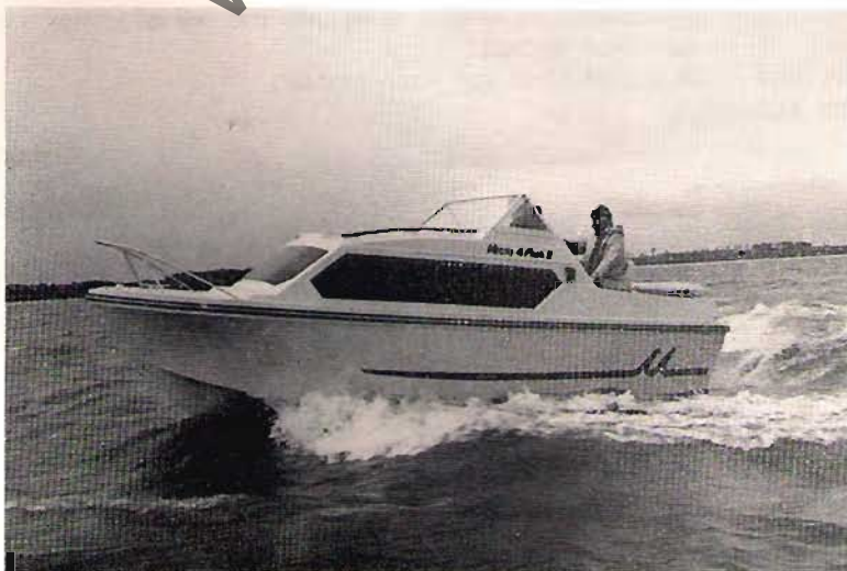
At home in the wide canals, rivers and inshore