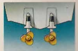
Offshore hull design