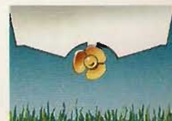
Riverboat hull design