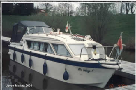
Upton Marina 2004