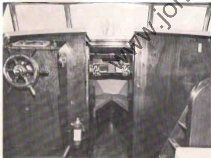
Bottom left The view from the fully weatherproofed cockpit to the self-contained forward stateroom.