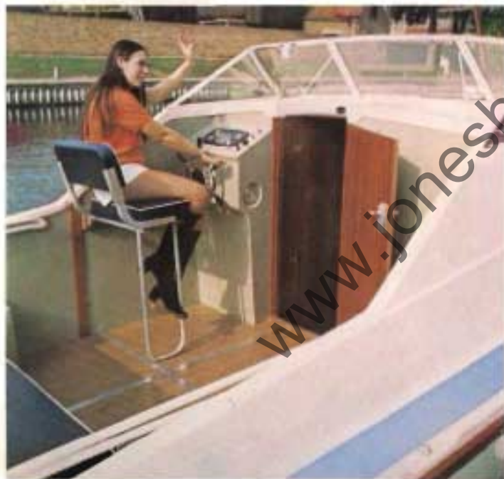
Bottom right Skilled craftsmanship is evident in the beautiful finish of the dinette and forward cabin.